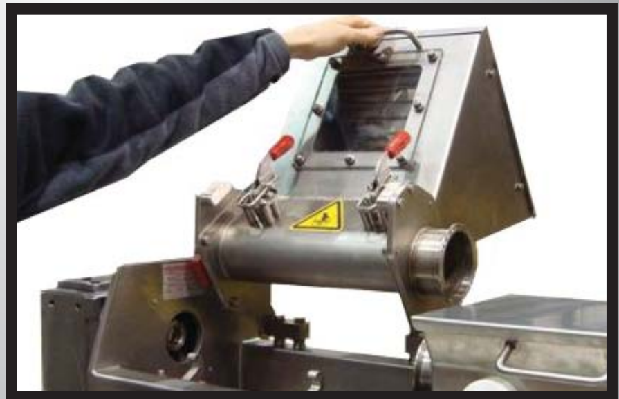
Rotating the Intake Hopper to Empty It