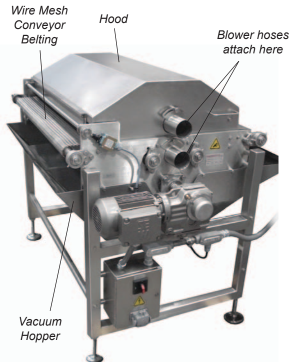
Flour Removal Conveyor (using a blower)