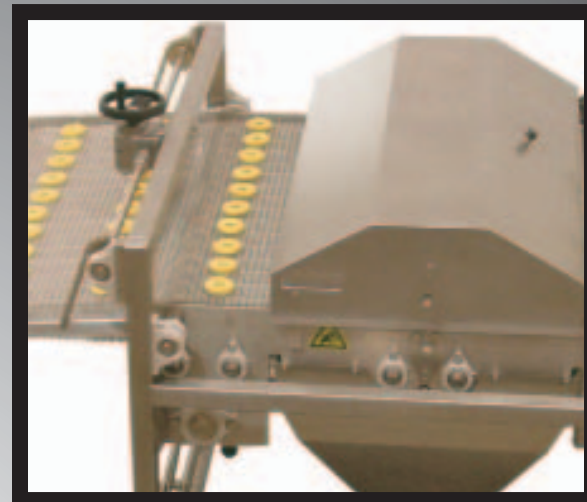
Removing Flour From Product With the Flour Removal Conveyor

Includes a filter/regulator and control valves necessary to activate the air knives when compressed air is used: 10 cfm @ 100 psi (5 liters/sec. @ 7 bar).