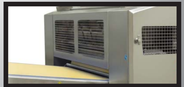
Dough Sheet Reduction