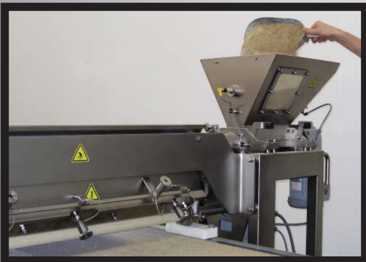
Side-Load Filling of the Intake Hopper

Contact us for more information: sales@moline.com