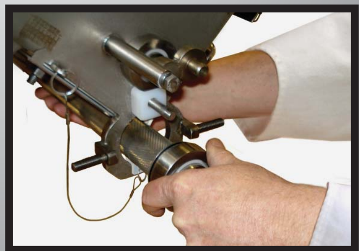
Changing Out Distribution Shafts