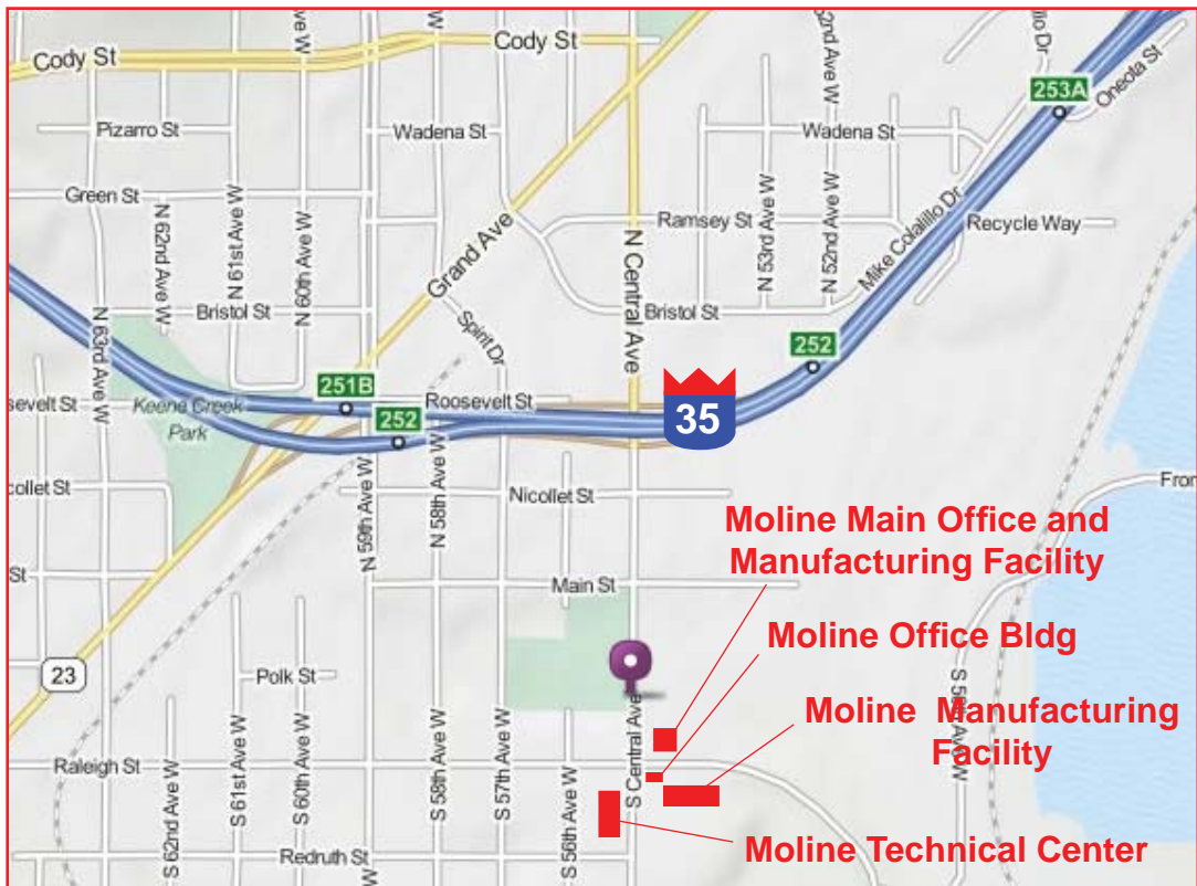
Detail of West Duluth (Moline Location)