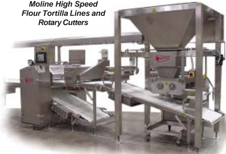
Moline High Speed Flour Tortilla Lines and Rotary Cutters

November 11-13, 2005 Gaylord Texan Resort & Convention Center Grapevine, Texas www.tortilla-info.com