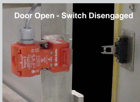
Keyed Positive-Opening Switch

It is recommended that switches used on older Moline equipment are replaced with the positive-opening style. Contact Moline Customer Service for details.