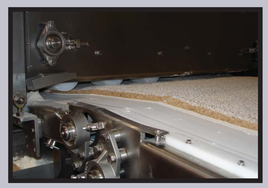
Cross Sheeting the Dough to Specific Width and Thickness