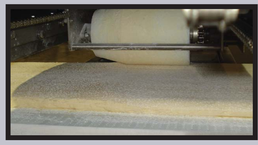
Cross Sheeting the Dough Sheet