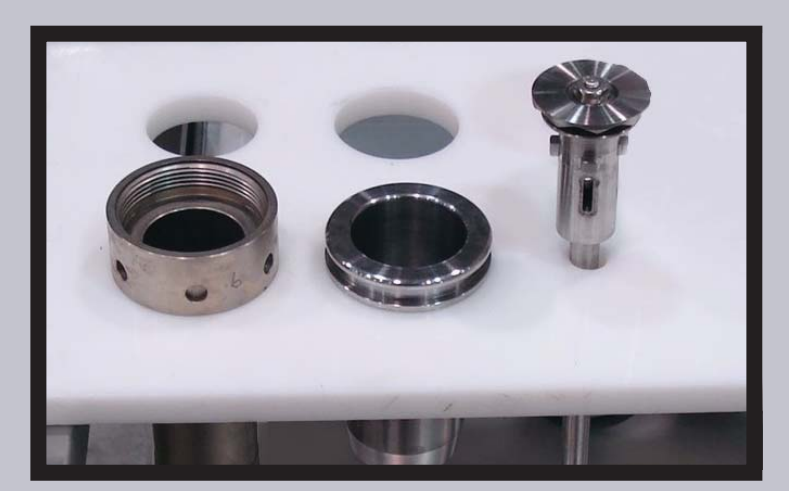
Cutter Storage Cart

The cutters are precision machined in matched sets and held to high tolerances. They must be handled carefully to prevent damage. To facilitate cleaning, maintain matched cutter sets and to prevent damage when not in use, a cutter storage cart is provided. The cart contains individual holes for each cutter component and trays for cleaning tools and other items.