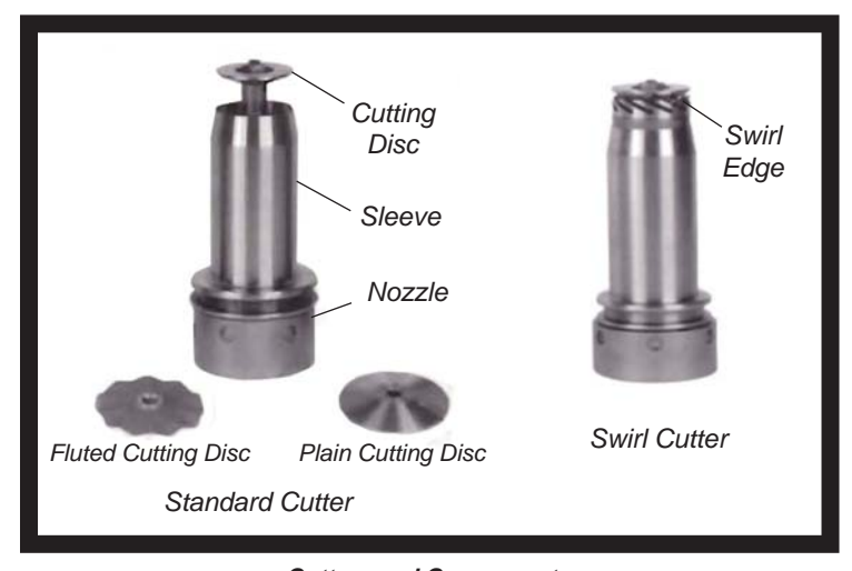
Cutters and Components

Swirl-shaped cake donuts can be extruded with standard or conversion cutters. They are available in three sizes: 1-3/8", 1-1/2" and 1-5/8" diameter.