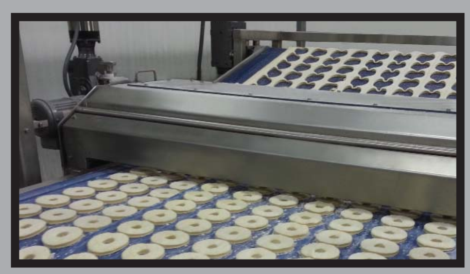
Self Threader During Production